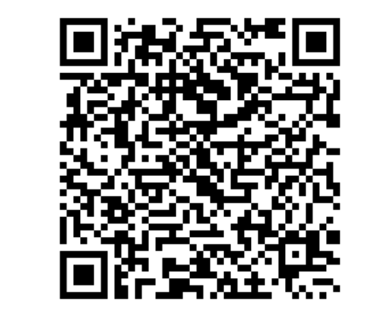
Scan the QR code for the Quality Management System